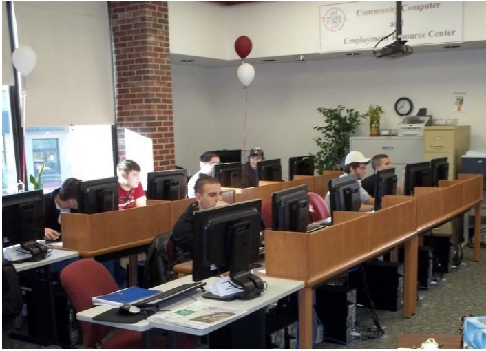
Classes in computer job searches

“At the moment that we persuade a child, any child, to cross that threshold, that magic threshold into a library, we change their lives forever, for the better.”— Barack Obama